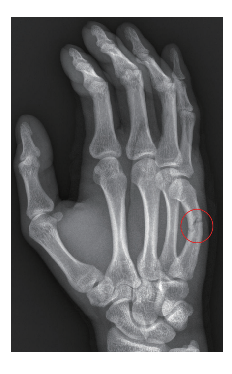
Fig. 1. Preoperative X-ray of the first fracture event. The X-ray shows the fracture of the fifth metacarpal bone shaft of the left hand (red circle).

A 30-year-old male visited Bucheon St. Mary's hospital with a swelling on his left hand after a slipand-fall injury. He was diagnosed with a left fifth metacarpal bone fracture by hand computed tomography (CT) and X-rays (Fig. 1). The first operation was performed 8 days after the injury, and open reduction was performed. To stabilize the fracture segments, a bioabsorbable plate and screws (Linvatec Biomaterials Ltd., Tampere, Finland) were used for internal fixation. Although the 1-year followup was uneventful, the patient visited us with swelling on the previous operation site. Physical exam showed just the swelling of the soft tissue of the operation site without any fluctuation, heat, or erythema. We recommended further evaluation such as an imaging study, but the patient refused to undergo it. Therefore, we decided to observe the patient without administering any medication because there was no evidence of infection. Four months later, the patient visited us again because of another trauma at the same site. Physical examination, CT, and X-rays were conducted, and the patient was diagnosed with a refracture of the fifth metacarpal bone with increased soft tissue swelling as compared to when we first noticed it 4 months previously (Figs. 2, 3). We