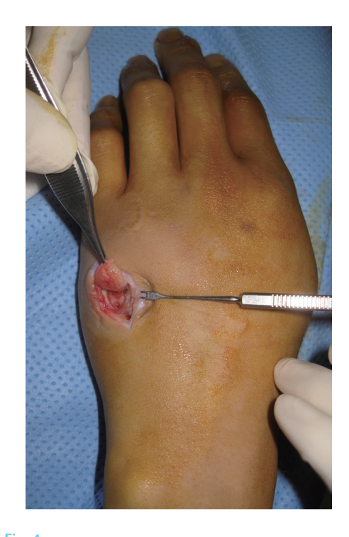
Intraoperative clinical photo. The mass is located just above the screw holes.