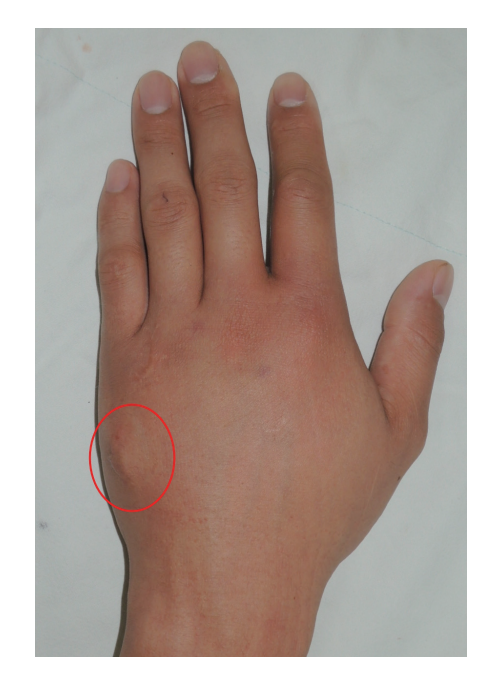
Fig. 3. Preoperative clinical photo of the second fracture event. Soft tissue swelling can be seen without signs of infection (red circle).