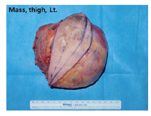
The specimen after total excision: an encapsulated, well-circumscribed mass measuring 12 cm x 10 cm and having, a firm, rubbery texture and brownish color.

shows a mixture of fibrous tissue, cellular components, and highly vascularized areas consisting of numerous, closely packed small to medium-sized blood vessels [2,3]. They usually affect adults between the fourth and the seventh decades of life (median, 50 years). Histological findings including immunohistochemistry are required for the diagnosis of SFT. Although SFTs are generally benign, wellcircumscribed soft tissue tumors, 10%-15% of SFTs will recur and/or metastasize [4]. SFTs are usually located in the pleura or other serosal surfaces. Despite the fact that they are seldom located in extrapleural soft tissue, this tumor has been reported in a variety of extraserosal sites. The known extrapleural locations of SFT are as follows: the lumbar extradural space, intrameningeal space, cervical spine, deep soft tissue of the neck, orbital space, pelvic space, retroperitoneal space, vagina, thyroid gland, mammary gland, prostate, nasal mucosa, liver, renal pelvis, and extremities. The orbits and the soft tissues of the