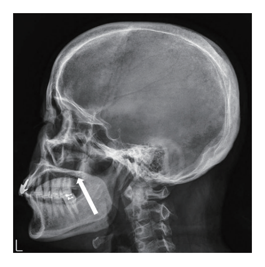
Fig. 1. Preoperative simple X-ray (white arrow points to the embedded needle).

The entry of a foreign object into a human body is a very common event. Workers who use sharp tools such as needles often meet with accidents. In Korea, acupuncture needles are very common sharp materials that can cause the entry of a remnant foreign object into a human body. The management of sharp foreign objects embedded in the head or neck area by early surgical removal is recommended [1]. We had a case of accidental needle breakage that caused a remnant foreign object to enter the buccal