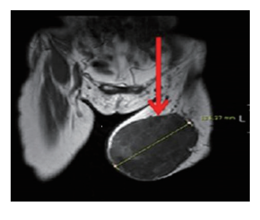
Fig. 2. Coronal contrast-enhanced T2weighted magnetic resonance imaging scan shows a large (about 12.4 cm \times 10 cm) lobulated soft tissue mass in the subcutaneous fat layer (red arrow). It shows a predominantly hyperdense mass with heterogeneous regions of low signal intensity.

shows a mixture of fibrous tissue, cellular components, and highly vascularized areas consisting of numerous, closely packed small to medium-sized blood vessels [2,3]. They usually affect adults between the fourth and the seventh decades of life (median, 50 years). Histological findings including immunohistochemistry are required for the diagnosis of SFT. Although SFTs are generally benign, wellcircumscribed soft tissue tumors, 10%-15% of SFTs will recur and/or metastasize [4]. SFTs are usually located in the pleura or other serosal surfaces. Despite the fact that they are seldom located in extrapleural soft tissue, this tumor has been reported in a variety of extraserosal sites. The known extrapleural locations of SFT are as follows: the lumbar extradural space, intrameningeal space, cervical spine, deep soft tissue of the neck, orbital space, pelvic space, retroperitoneal space, vagina, thyroid gland, mammary gland, prostate, nasal mucosa, liver, renal pelvis, and extremities. The orbits and the soft tissues of the