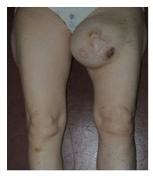
Fig. 1. A 76-year-old woman presented with a huge, protruding, firm, and fixed mass measuring 15 cm \times 13 cm on her left inner thigh.