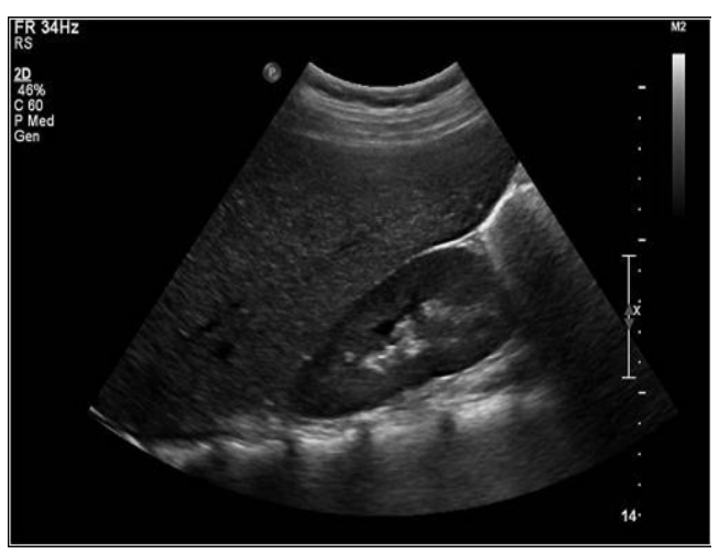
Fig. 3. Abdominal ultrasonography showing hepatomegaly with increased hepatic echogenicity.