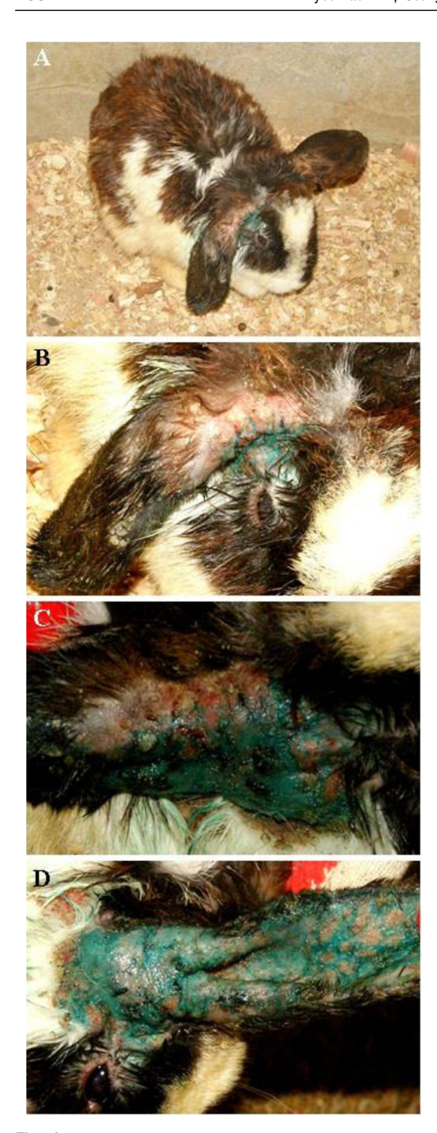
Fig. 1. Clinical signs of the lop-eared rabbit. Note the poor body condition and the dull and depressed appearance (A), the crusts on the external ear canal (B, C), and the crusts on the internal surface of the pinna (D).

mobile. No other causative agents were recognized. The mites were 500 \sim 700 µm in length, oval in shape, and all four legs projected beyond the body margin (Fig. 2A). The characteristic pointed mouthparts and three-jointed long pedicels with funnel-shaped pulvilli (Fig. 2B) differentiate P. cuniculi from Chorioptes spp. In addition, the males had rounded tubercles in the posterior abdomen (Fig. 2C). The eggs that were detected were approximately 200 \sim 250 µm in length and oval in shape (Fig. 2D) and their morphology was in consistent with the previous description on those of P. cuniculi (Taylor et al, 2007).