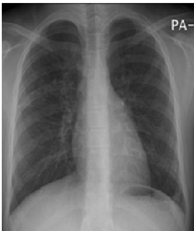
Fig. 3. Chest radiograph after 1 month of steroid therapy.

L, respectively. Serum IgE and IgG antibodies specific to A. fumigatus were positive (>200 U/mL), and antigen was negative. A. fumigatus -specific IgE level was 15.4 kU/L. Serum humoral antibody levels were normal (IgG, 1,163.0 mg/dL; IgM, 168.7 mg/dL; and IgA, 136.8 mg/dL). T-cell subsets were also within normal limits (lymphocytes, 3,612/mm 3 ; CD3 + T cells, 2,636/mm 3 ; CD4 + T cells, 1,950/mm 3 ; CD8 + T cells, 1,300/mm 3 ; and CD4 + /CD8 + T cells, 1.5) and the serum levels of C3 and C4 were 146.93 mg/dL and 23.78 mg/dL, respectively. The alpha1-antitrypsin level was also within normal limits (186.3 mg/dL). Pulmonary function test was normal (forced vital capacity [FVC], 2.62 L (81% pred); forced expiratory volume in one second (FEV 1 ), 2.47 L (84% pred); FEV 1 /FVC, 86%). However, methacholine provocation test showed airway hyperreactivity (AHR) (PC 20 =5.31 mg/mL). The diagnosis of seropositive ABPA was assumed, and oral prednisolone (1 mg/kg/day) was added to antifungal treatment. After 1 week of oral prednisolone, chest x-ray consolidation began decreasing, and IgE level lowered to 616 kU/L with blood eosinophils of 400/mm 3 . The patient was treated with oral prednisolone (1 mg/kg/day) for 10 days and tapered down over the following days. One month later, chest x-ray abnormalities were cleared up completely and symptoms improved continuously for the following days (Fig. 3).