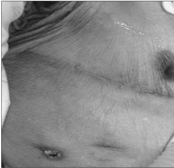
Fig. 1. Photograph of the right minithoracotomy wound.