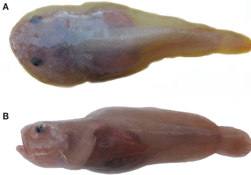
Fig. 2. Psychrolutes pustulosus , ESFRI 2070, 92.4 mm SL, Pohang, southern East Sea, Korea. (A) Dorsal; (B) Lateral view.

bital length 19.8~26.0; snout length 10.8~12.8; upper jaw length 13.6~16.2; eye diameter 6.1~6.6; suborbital width 3.7~4.6; interorbital width 11.9~14.8; predorsal length 7.4~8.9; prepectoral length 32.5~37.9; preanal length 54.4~60.8; prepelvic length 27.1~32.0; preanus length 49.4~52.5; pectoral fin length 31.4~36.5; pelvic fin length 15.4~19.9; dorsal fin length 14.7~16.0; dorsal fin base length 56.6~67.2; anal fin length 15.8~17.7; anal fin base length 25.8~37.9.