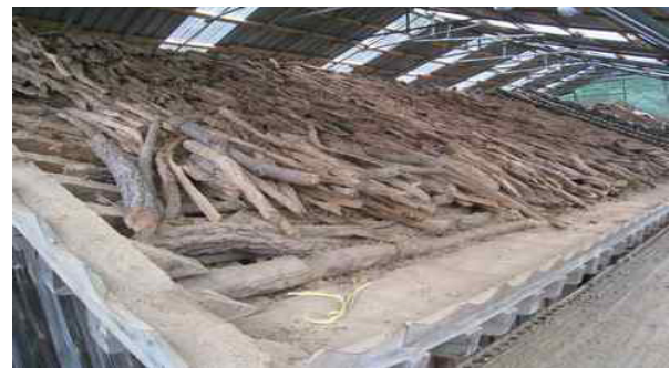
Photo 5. Small Wooden Sticks Used for Kiwa Roof in AH

AH Village is a representative Korean traditional folk village of which the houses are mainly timber structure. Roof of each house is 'Choga' or 'Kiwa'. Backbone of 'Choga' roof is made by timber structure and it is covered with straw thatch so that we can investigate they have many weak points against fire disasters. 'Kiwa' roof on the other hand has its own fire-resistance so that danger of flying fire from external source can be relatively lower than 'Choga' roof. But there are a lot of small wood sticks inside the 'Kiwa' roof in AH Village as shown in Photo 5. If fire occurs inside the 'Kiwa' roof to attack these timber sticks, we can easily expect much difficulties in fire-fighting process. Narrow alley between houses in the village is another hindrance in case of fire-fighting using fire trucks or other mechanisms [8].