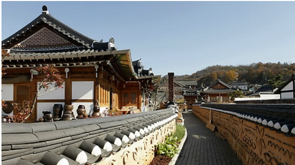
Photo 3. Narrow Alley between Hanok Houses in JH Village

According to our detailed investigation, the major part of hanok houses in JH village do not have inside sprinklers, and fire-fighting facility at the beginning is a Powder Extinguisher. There is a fire station near Jeonju Hanok Village so that they can prepare against big fire disaster. But narrow alleys between hanok houses are preventing the fire trucks from coming inside the fire place as show in [Photo 3].