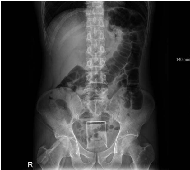
Fig. 1. Pelvic X-ray, metal ring in pelvis.

All foreign bodies were extracted from the patients under anesthetics: spinal (2 patients), general (2 patients) and from spinal to general (2 patients). The endoscopist pulled out the foreign body in three cases. Two patients had their operative position changed from Jack-Knife position to lithotomy. The 45-year-old male patient with the 12×3 cm sized sexual toy glass in his rectum had two operations. At first, we did not extract the foreign body under the 1 st spinal anesthesia cooperating with the endoscopist in lithotomy position. We performed 2 nd operation two days later under the general anesthesia with the endoscopist's help to pull the foreign object more distal so we could reach it and removed