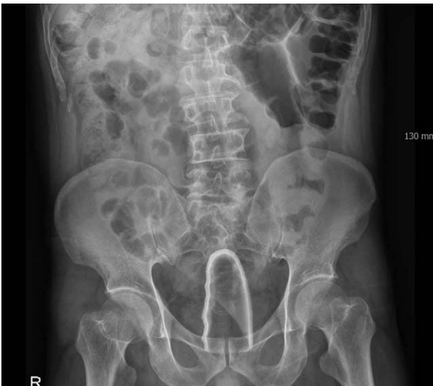
Fig. 2. Pelvic X-ray, laboratory beaker in pelvis.