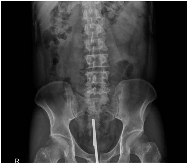
Fig. 4. Abdominopelvic CT, sexual toy glass in rectum.

When you meet the patient with rectal foreign