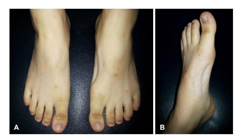
Figure 2. Appearance of steroid induced atrophy and hypopigmentation of the left medial foot after triamcinolone injection (A, B).