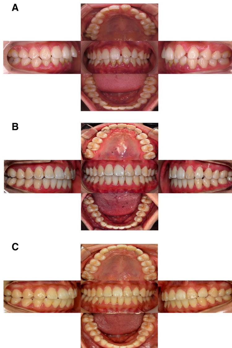
Fig. 1 a Before orthodontic treatment. Intraoral photos were taken on 2 July 2010. b After orthodontic treatment. Intraoral photos were taken on 1 December 2012. c Follow-up check. Intraoral photos were taken on 13 December 2014

The patient also had right-side facial asymmetry. On June 9, 2010, she was evaluated by clinical examination,