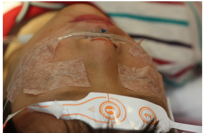
Fig. 2. Patients with nasal cannula and sensor of S/5 Entropy ™ Module.

Amoxicillin, 650 G, oral, administered 1 hour prior to each dental treatment as a prophylaxis to bacterial infection, and 8 vol% inspired sevoflurane gas administered using a full facial mask. After achieving loss of consciousness, the facial mask was substituted with a nasal cannula (Softech BI-FLO ® Cannula 1844, Teleflex Inc., Pennsylvania, USA)(Fig. 2). This nasal cannula is composed of two parts, where one supplies the oxygen and sevoflurane and the other detects expired gas of the patient (Fig. 3). Sevoflurane vaporizer was set to deliver 100% oxygen at gas flow of 2.0 L/min. End-tidal sevoflurane concentration as well as patient's respiration through capnography line of the nasal cannula was monitored throughout sevoflurane insufflation sedation.