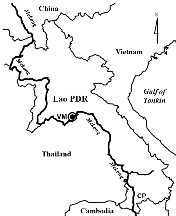
Fig. 1. Surveyed areas of Vientiane Municipality (VM) and Champasack Province (CP), Lao PDR.