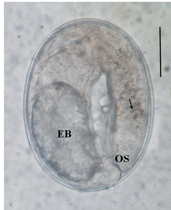
Fig. 2. A metacercaria of Procerovum varium detected in a climbing perch, Anabas testudineus , from a local fish market of Vientiane Municipality, Lao PDR. It is elliptical and 175 × 136 μm in average size, and has brownish pigment granules, a muscular oral sucker (OS), a pair of eyespots (arrow) lateral to pharynx, a ventral sucker defectively located from median, a thick-walled expulsor, and a D-shaped excretory bladder (EB) with grouped granules. Scale bar is 50 μm.

Trematodes in the genus Procerovum (Heterophyidae) are characterized by possessing a single testis and a long prominent seminal vesicle modified into an expulsor. Only 3 species, i.e., P. varium , P. calderoni , and P. cheni , have been certified for their validity based on the morphology of the seminal vesicle. Our specimens (304 × 186 μm) were somewhat smaller