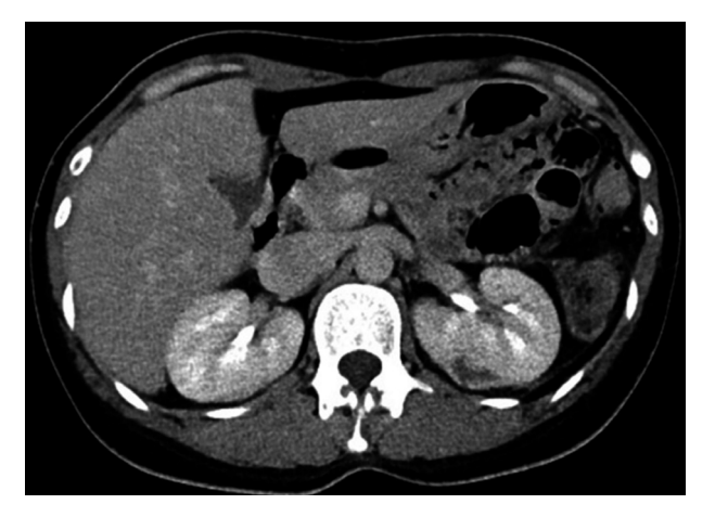
Fig. 3. At the 3-month follow-up evaluation, markedly improved bilateral subcapsular hematoma was observed on contrast-enhanced computed tomography scans. Only scanty hematoma remained at the left kidney.

Since Page kidney was first described on clinical grounds