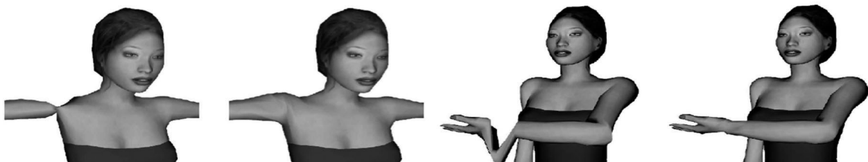
Fig. 3. Comparison between LBS and DLB (Left), Log-matrix and DLB (Right) (19).

Non-rigid deforming parts such as hair or clothes is also another interest of this area (30-32). Velocity, bending, stretching of mass-spring systems play a key role in motion of this deformation. Hyun (33) proposed a sweep surface instead of skeleton. The sweep surface can afford to realize anatomical details such as bone-protrusion, muscle bulge, skin folding. The GPU-based collision detection model helps improve performance of this method.