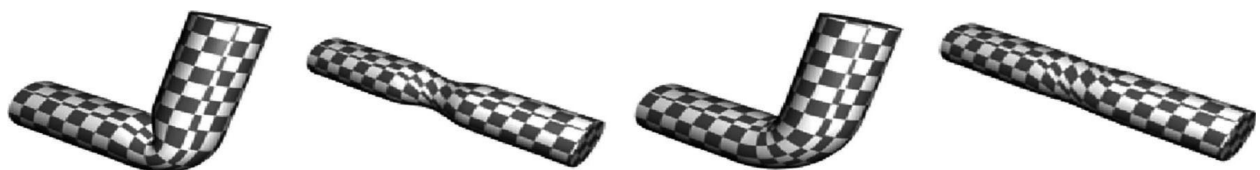
Fig. 2. Skin collapse (Right), Candy wrapper (Left) artifacts and Result of Right (16).

Some researchers proposed methods to solve this problem without changing of LBS's equation (15, 16). Wang (15) proposed Multi Weight Enveloping (MWE) assigns 12 weights to each transform matrix related to vertex deformation. These numbers are derived from the number of motion-related component of homogeneous transform matrix (3×3 rotation, 3×1 translation). This method solved these above artifacts. But 12 weights are too many for animation control. Also implementation becomes complex with this method. Merry (16) pointed out that 12 weights are not necessary for solving LBS's problem. The