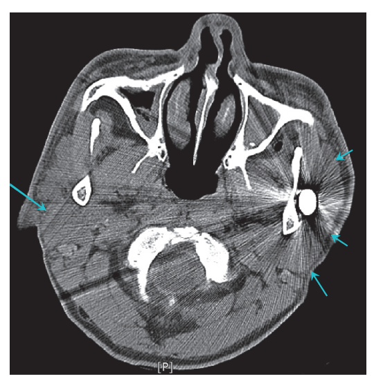
Fig. 4. Facial bone computed tomography scan disclosed a radioopaque foreign body penetrating through left frontoparietal area. There was no penetration of the foreign body into left parotid gland (the blue arrows indicate both parotid glands).