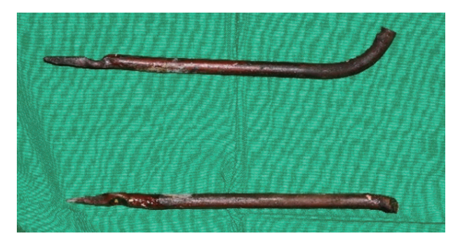
Fig. 5. Removal of rusted iron bars: 18-cm from right (upper), and 23-cm from left (lower).

ment injury patients should be considered as major trauma patient before thorough neurologic, vascular, and airway assessment are completed. Therefore the most important pre-hospital management of patients are 'doing' and 'not doing' procedures to avoid further injuries. In our case, the patient was suspended by iron fence in upside down position for 5–6 hours. If a patient is found suspended on a penetrating object, measures should be taken on site, to try to reduce the strains on the body due to gravity. The object is fixed or immobilized, like our case; the size of the piercing object should be reduced. After that, 'not doing' any attempt to remove the object in situ before hospital. Because doing so could cause further damage surrounding vital tissues, particularly large blood vessels and nerves.