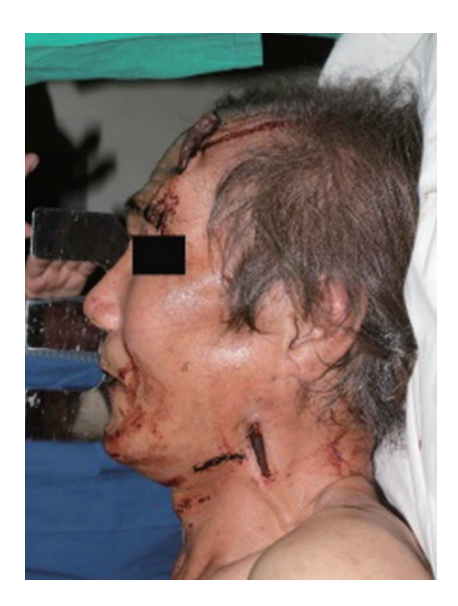
Fig. 1. A 69-year-old male with penetrating injury with rusted iron rods on his head came to the Emergency Department