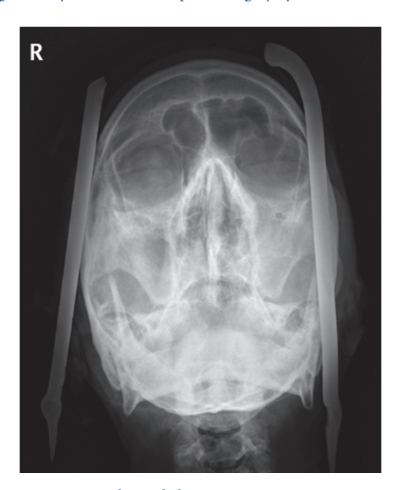
Fig. 2. Preoperative plain radiologic image.

with penetrating into right auricle and left masticator space and left lateral neck with no definite parotid gland penetration (Figs. 3, 4). He was admitted to the plastic surgical department and got emergent operation for removal of foreign bodies under general anesthesia (Fig. 5). After removal of the materials, the tunneling wounds on his both parietal areas were massively irrigated with normal saline and surgical drains were placed to prevent hematoma