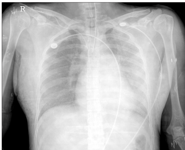
Figure 1. The plain chest radiography shows ground glass opacity and consolidation in both lung fields.

The patient was admitted to the intensive care unit and treated with mechanical ventilation owing to worsening hypoxemia. After several days, hemorrhagic eruptions occurred in anterior chest area. She was initially administered antibiotics, corticosteroids and diuretics. Hypoxemia was gradually improved. After 5 days, the result of initial blood culture showed no growth and there was no evidence of fever. Therefore, we could exclude the septic embolism and discontinued the antibiotics. She was weaned from mechanical ventilation. At the eighth day of hospital admission, she was discharged. After one month, she was completely improved and follow-up chest CT showed improvement of the previous pulmonary lesion without fibrosis (Figure 3).