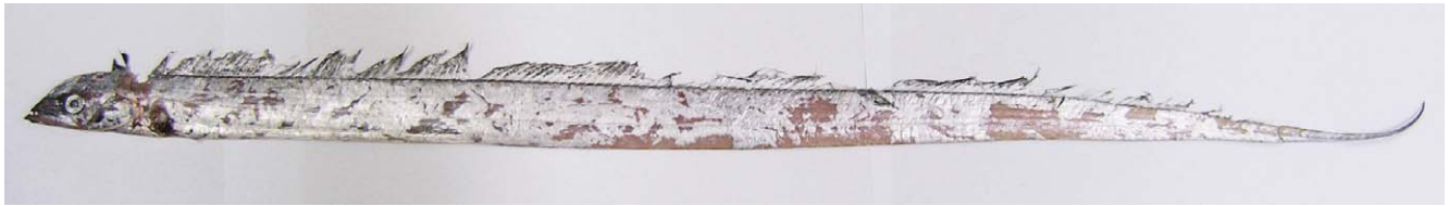
Fig. 1. Tentoriceps cristatus , JNU-1174. 619.0 mm SL, Jeju Island, Korea.