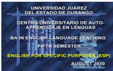
(Figure 2) Complex Presentation

There have been a number of education systems which could be used by language linguistic scholar who are teaching English. The method of study by means of multimedia in foreign language like English cause many students to have interesting.