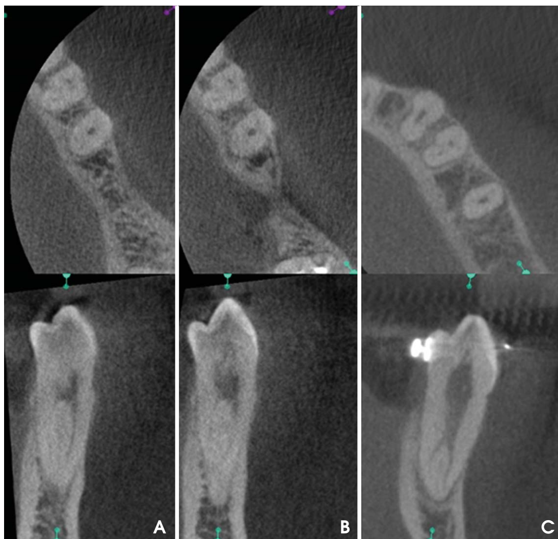
Fig. 2. A. Axial (up) and buccolingual (down) CBCT images show the Vertucci type II configuration. B. Shapes not included in Vertucci's classification. One canal in the coronal third of the root, three canals in the middle third, and one canal in the apical third. C. Axial (up) and buccolingual (down) CBCT images show the Vertucci type V configuration.

Data were tabulated and analyzed using IBM SPSS sta-