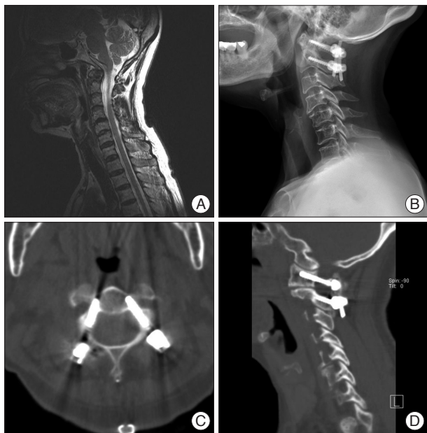
Fig. 2. A 66-year-old female had C1-2 instability due to complication of rheumatoid arthritis. Postoperative X-ray and CT scans show that the screw was safely inserted through the C1 lateral mass and the C2 pedicle. A : Pre-operative MRI. B : Post-operative cervical X-ray. C and D : Postoperative CT scans.