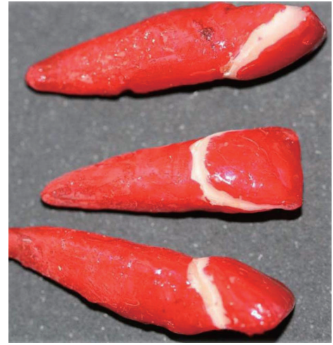
Fig. 3. Specimens were painted by nail varnish to avoid the contamination with radioisotope.