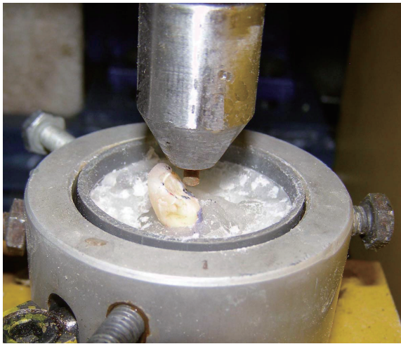
Fig. 4. Teeth were mounted for the cyclic loading. The contact point was adjusted to the cingulum.