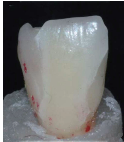
Fig. 6. An example of cohesive failure in laminates.

Although the ideal setting for the experimental study of dental materials and restorations is the oral cavity, clinical trials are time-consuming and not always cost-effective. 15,16