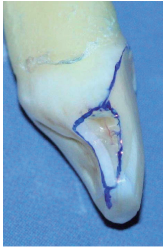
Fig. 2. The design of PLV preparation on a tooth with class IV cavity. The blue line demonstrates the position of interproximal margin.