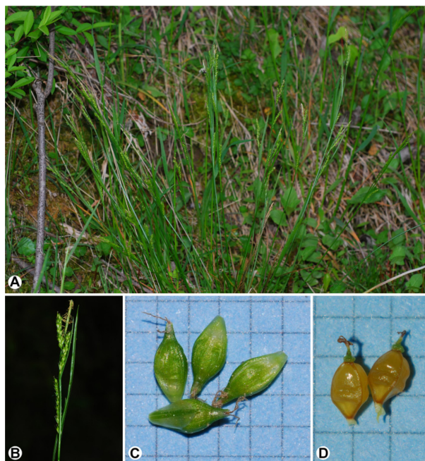
Fig. 2. Photographs of Carex rugata Ohwi. A. Habit; B. Inflorescence; C. Perigynia; D. Achenes.