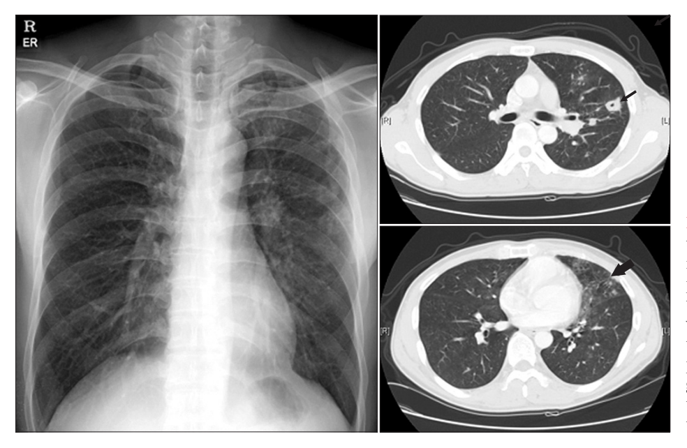
Figure 1. Chest X-ray and chest computed tomography (CT) in case no. 3. Chest Xray revealed multiple small nodules and patchy consolidations predominantly in the left lung field, and the chest CT revealed a cavitary nodule (thin arrow) and tree-in-bud appearance in the left upper lung and left lingular segment, with ground glass opacities (thick arrow) due to aspirated blood in the left lower lung, that suggests tuberculosis reactivation.

A 45-year-old man visited the ED on December, 2009 because of fever and cough for one day and one incident of hemoptysis estimated at about 400 mL. He had a history of pulmonary tuberculosis diagnosed in 2007 and reported a complete recovery after treatment. A physical examination upon admission revealed a high body temperature (38.1°C) and increased pulse rate (105/min), while his breath sounds