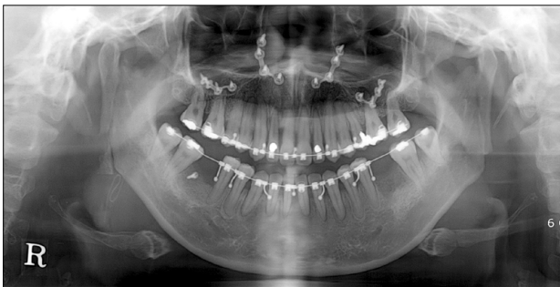
Fig. 2. Ten weeks after the orthognathic surgery, panoramic radiograph, showing discontinuity of proximal segment by radiolucent lesion.

graph and computed tomography (Fig. 2, 3) that demonstrates radiolucency and destructive bony change at the angle of right mandible with an evidence of sequestering bony segment. The patient was started on intravenous antibiotics (combination of 3rd generation cephalosporin and Metronidazole) upon admission, and she was taken to the operating room for removal of the sequestered bony segment and a drain placement. Intra-operatively, an approximately 15 mm sequestrum at the inferior aspect of the proximal segment was noted and removed. A three month post-operative panoramic radiograph (Fig. 4) was unremarkable, with resolution of symptoms.