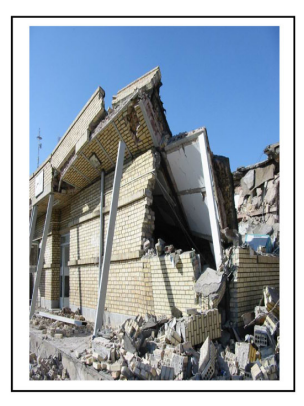
Destruction and out of servicing of Hospital after Bam earthquake, 2003

<Figure 2> Comparison of California and Bam buildings destruction in the earthquakes in year 2003