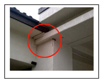
Minor damage at column connection to Twin Cities Hospital in Templeton, California, 2003