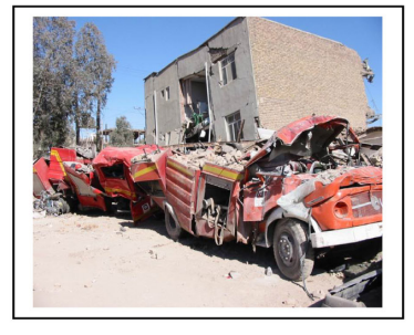
Destruction and out of servicing of fire station after Bam earthquake, 2003