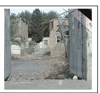
Destruction and of Ferdowsi high school building after Bam earthquake, 2003