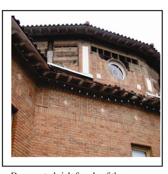
Damage to brick façade of the Atascadero City Hal after California earthquake, 2003