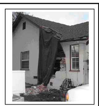
Chimney damage to residential buildings after California Earthquake 2003