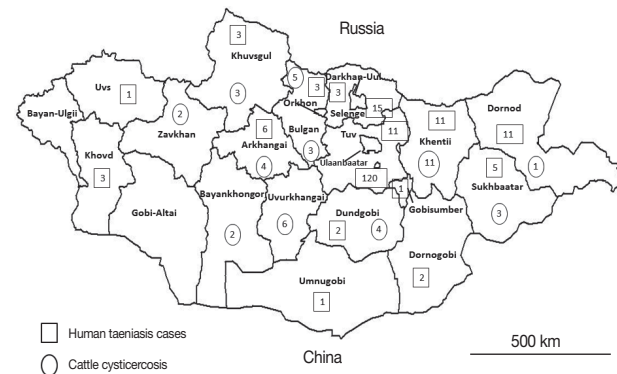
Fig. 1. A map of Mongolia showing the geographical origins of Taenia saginata detected from people and cattle. Numbers in open rectangle and open circle show human taeniasis cases and cattle cysticercosis, respectively.

worm carriers was extracted using the QIAamp DNA Stool Minikit after disruption of embryophores with glass beads [3]. The extracted DNA was kept at -20°C until further analysis could