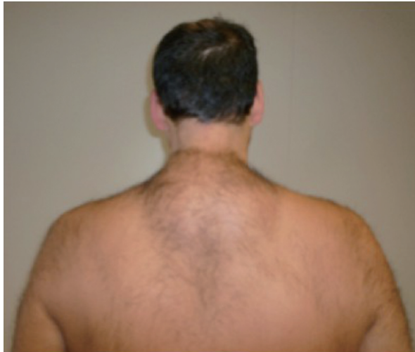
Fig. 2. Preoperative situation.

[PTEN] genes). In addition, a recent report indicates that a few patients with hereditary retinoblastoma also have lipomas. In the pedigree presented in this patient, the autosomal dominant transmission of multiple lipomas is linked to a mutant retinoblastoma (RB) 1 allele. Therefore, early diagnosis is very important because the progeny is surely affected.