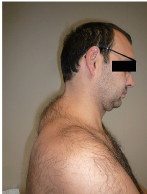
Fig. 1. Preoperative situation.

In order to document the presence of retinoblastoma, multiple endocrine neoplasia (MEN) 1 and lipomatosis were evaluated with an preoperative genetic exam to confirm the diagnosis of this rare and complex syndrome; in fact, hereditary predisposition to lipomas is observed in familial multiple lipomatosis and benign cervical lipomatosis (and can also be associated with mutations in the MEN1 and phosphatase and TENsin homolog