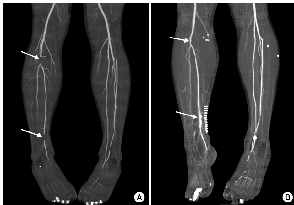
Fig. 1. (A) Computerized tomography (CT) angiography shows segmental obstructions of the below-knee right popliteal artery and posterior tibial artery (arrow). The anterior tibial artery is obstructed in this image. (B) CT angiography shows good patency of the segmental obstructions of the below-knee right popliteal artery and patch angioplasty of the right posterior tibial artery after surgery (arrow).

catheter was not passed under the obstruction of the posterior tibial artery. However, the arteriotomy site was closed with patch angioplasty because of the occurrence of a large amount of back bleeding. After the first operation, the patient's symptoms did not improve and the patient requested reoperation to alleviate the symptoms. The blood vessel had surrounding coalescence with an inflammatory reaction. We performed vein patch angioplasty in the segmental obstruction of the posterior tibial artery 2 weeks after the first operation. Because of the thick intima and fibrosis, endarterectomy was not possible. After the operation, the patient's symptoms improved and he was discharged on postoperative day 15. His ABI was 1.0.