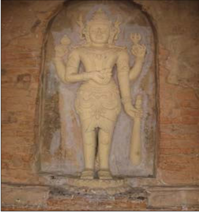
Figure 7. The Standing four-armed Vishnu at Nathlaung Kyaung

Only the inter wall of the outer corridor of the temple is left. It contains ten niches rounded at the top: four on the east side and two each on the south, west, and north sides near the corners. Their chief purpose is to house stone reliefs showing the Avataras of Vishnu, Preserver of the Universe. The series starts from the center of the eastern section, with the worshipper keeping his right side to the temple as he makes the circuit (Luce 1970: 221). According to the southern recension of the Mahābhārata , the Ten incarnations are the Fish (Representing the beginning of life), the Tortoise (Representing a human embryo just about to grow tiny legs and a huge belly), the Boar (Representing a human embryo which is almost ready), Manusihā or the Man-Lion (Representing a new born baby-hairy and cranky, bawling and full of blood—and is regarded as the greatest