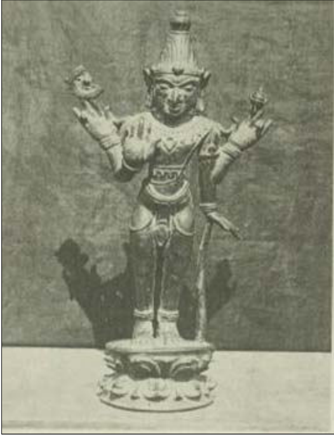
Figure 1. Vishnu at Bagan Museum