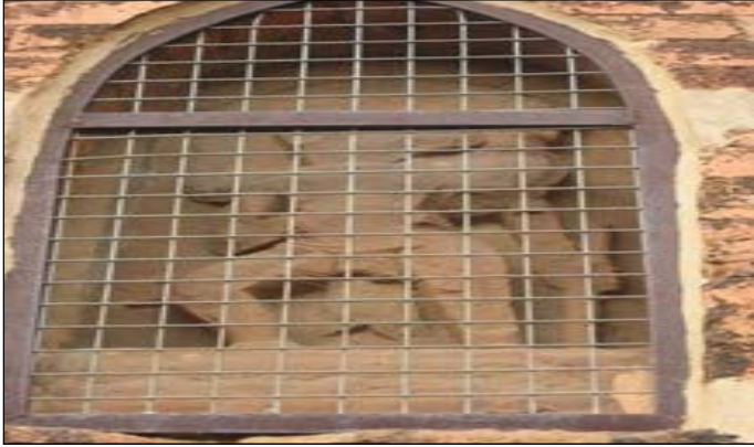
Figure 8. The Boar, avatar of Vishnu at Nathlaung Kyaung

The atheist demon Hiranyakas'ipu (Gold Cushion) ill-treats his son Prahtāda for praising Vishnu. Hiranyakas'ipu asks where Vishnu is. His son replies that the god is everywhere, even in the palace-pillar. Furious, the demon kicks the pillar. The Man-Lion emerges and tears him to pieces. Brahmā had not granted the demon to slain by man nor animal. The sculpture is on the south face near the southwest corner (Luce 1970: 221) <Figure 9>.