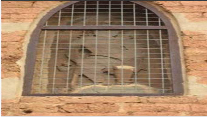
Figure 10. Vāmana, avatar of Vishnu at Nathlaung Kyaung