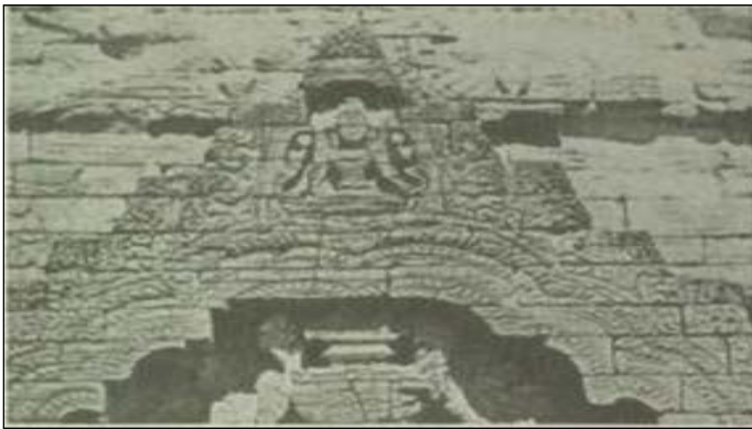
Fig. 26. Srī at Nanpaya