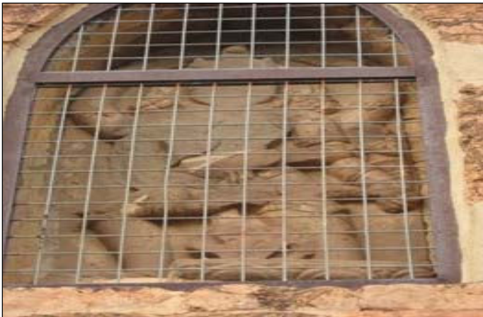
Figure 9. The Man-Lion, avatar of Vishnu at Nathlaung Kyaung