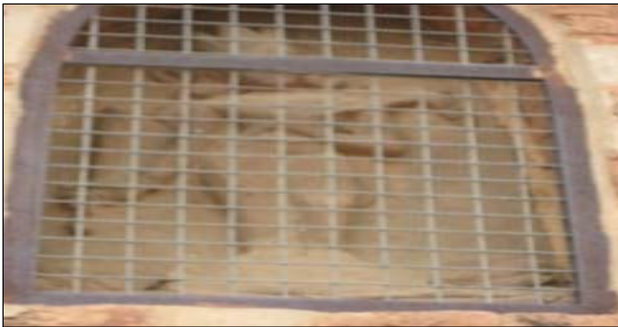
Figure 11. Vāmana, avatar of Vishnu at Nathlaung Kyaung