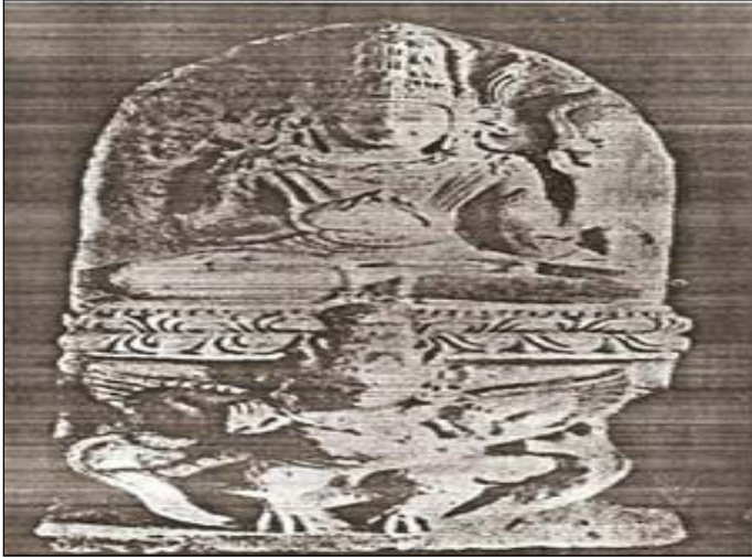
Figure 6. Vishnu at Nathlaung Kyaung