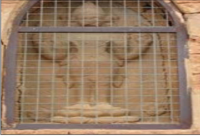
Figure 25. Sūrya at Nathlaung Kyaung

Dr. Ray remarked precisely for this reason that it is not one of the avatars of Vishnu, but seems to be an image of Sūrya of the South Indian type. The position of the two hands as well as the lotus buds held in one line with the shoulders is a significant indicator. No less significant is the number of the hands, which is a distinctive feature of South Indian Sūrya images, as well as the strictly erect standing posture. Sūrya in South India does not generally wear boots nor ride a horse-drawn chariot. Dr. Ray stresses the very intimate relation of Vishnu with the Vedic Sūrya . In the Vedas, Sūrya is never a supreme god, but is always identified with the sun. The idea that Vishnu is the sun appears to be still maintained in the worship of the Sun as Sūrya Nārāyana (Ray 1932: 42-43).