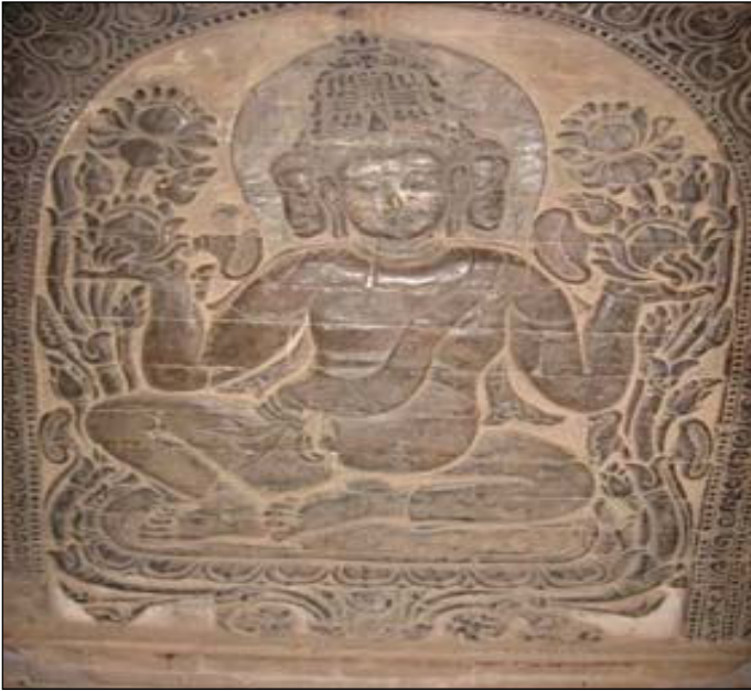
Figure 19 b. Brahmā at Nanpaya