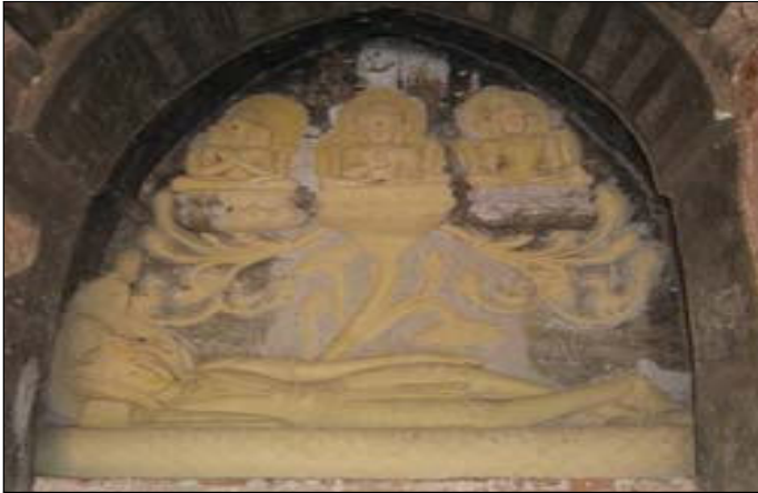
Figure. 4. Vishnu reclining on Serpent Ananda at Nathlaung Kyaung

Garuda has more similarities with Khmar rather than the Indian models, and is closest to those found on the lintels from the 10th and 11th century Khmar sites, sharing their power and strength (Gutman et al. 2012: 8) <Figure 5, 6>.