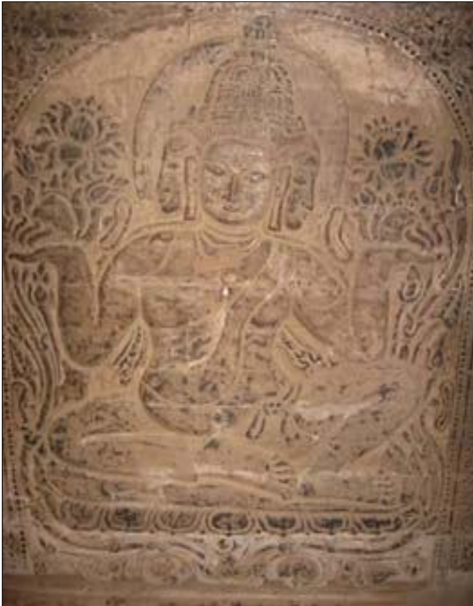
Figure 19 a. Brahmā at Nanpaya

the flowers. The pose of hands and the lotus forest are strikingly like those of the Brahmā pair in the porch paintings of Myinkaba Kubyaukkyi. The gods in the paintings however sit in padmāsana with their head erect and their arms symmetrical. In the Nanpaya, one knee is raised on which the elbow rests. The head with its gorgeous tower of braided hair and double-lotus finial gently leans that way. The flattened knee is always toward the centre, the outer knee raised, the supported elbow slightly higher than the other. The faces are more flexible in their eternal calm and posture <Figure 19 a, b>.