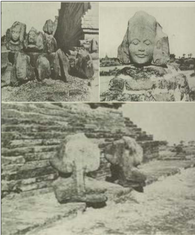
Figure 21. Ganes'a and other divinities at Shwesandaw (Mahapeinnè)

Vināyaka, from which his Old Myanmar name, Mahāpinaypurhā is derived (Luce 1970: 205). According to tradition, the original name of Anawrahta's Shwesandaw is Mahapeinnè , and it is sometimes called the Ganesh temple after the elephant headed Hindu god (Aung Thaw 1978: 75) Ganes'a and other Hindu divinities were placed at the corners of the different pyramidal stages as guardian deities of the Buddhist shrine. The stone figures of Hindu deities were placed originally at the corners of the five terraces of the Shwesandaw <Figure 21>. They symbolically guard, the ascent of Mt. Meru with the Cūlāmanicetiya of TāvatiÑsa at the summit (Luce 1970: 205).