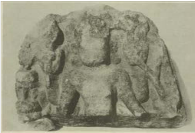
Figure 3. Vishnu at Shwegugyi Temple