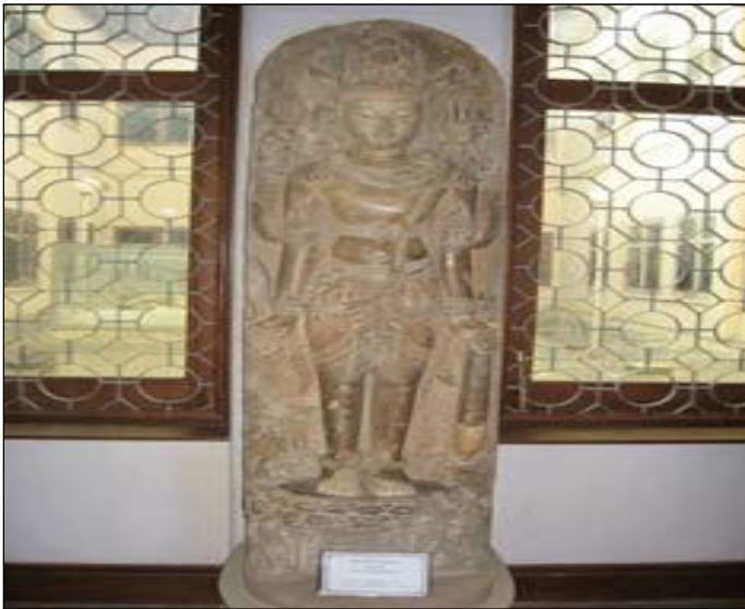
Figure 17. Shiva at Bagan Museum

mace in the lower ones. It is crowned of braided hair, jathāmukutha . The image is much disfigured, but its Indian anklets are visible, and beneath the feet is an animal broken, probably representing a bull. The image is that of Shiva (Luce 1970: 215). Dr. Ray comments that it is carved out of grey soft sandstone in bold and round relief. Its form and execution is distinctly South Indian, and may on stylistic grounds be dated not earlier than 12 century A.D. The presence of elaborate ornamental details is a characteristic feature of late mediaeval sculptures, and the static heaviness invariably remains one that is South Indian, especially Cola (Ray 1932: 59-60, 82) <Figure 17>.