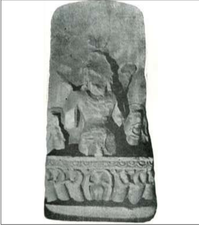
Figure 24. Sūrya at Rakhine

At Bagan, Sūrya can be seen in the last niche of Nathlaunggyaung, on the right hand side of the entrance steps. Duroiselle describes it as standing on a lotus flower from which two other smaller ones spring. The arms are placed close to the body, which is bent upwards at the elbows, and with each hand holding a lotus bud on a level with the shoulders. It wears a crown, its distended earlobes hang down and touch the shoulders under the weight of the large ear-ornaments. It has bracelets, armlets, and anklets, its lower garment is tucked up and reaches as far as the knees. Lines showing the folds are visible. This also represents one of Vishnu's Avatars (Duroiselle 1912-13: 138) <Figure 25>.