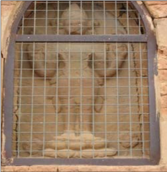
Figure 14. Sūrya, avatar of Vishnu at Nathlaung Kyaung