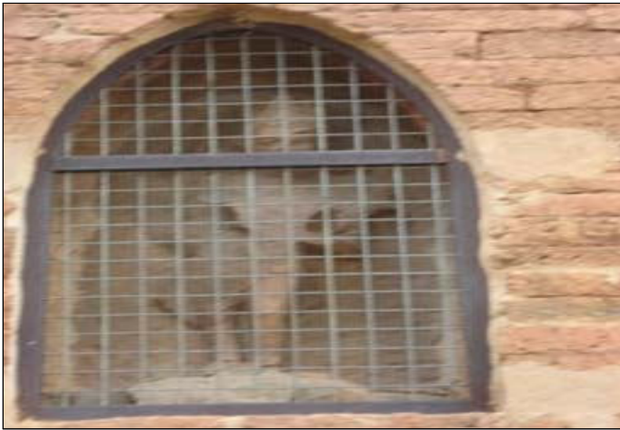
Figure 13. Parasurāma, avatar of Vishnu at Nathlaung Kyaung

crowned by a usual headdress and it is adorned with usual ornamental decorations. The body stands erect but the head is slightly slanted towards the right. Each of the two hands, hold respectively a staff-like object, perhaps a khadhga or sword raised upwards, and an axe, resting on the left shoulder (Ray 1932: 41). The sculpture is found in the north sector near the northeast corner <Figure 13>.