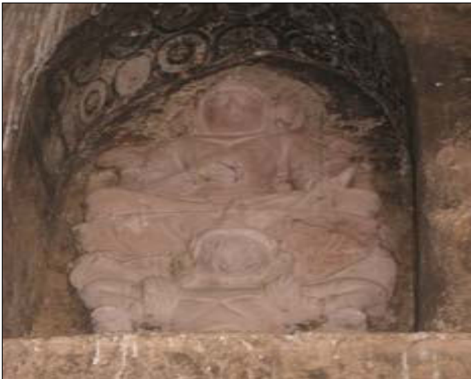
Figure 5. Vishnu at Nathlaung Kyaung