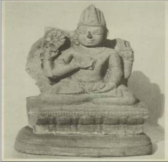
Figure 2. Vishnu at Bagan Museum