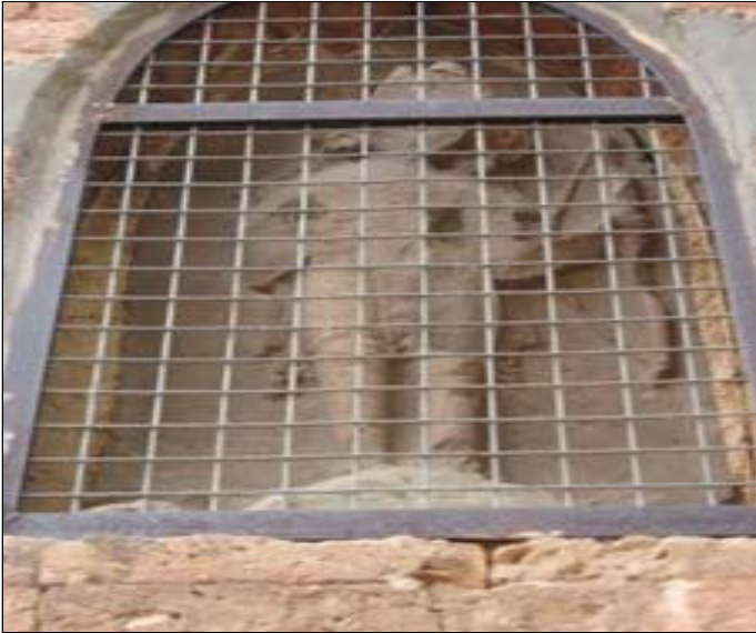
Figure 12. Rāmacandra, avatar of Vishnu at Nathlaung Kyaung