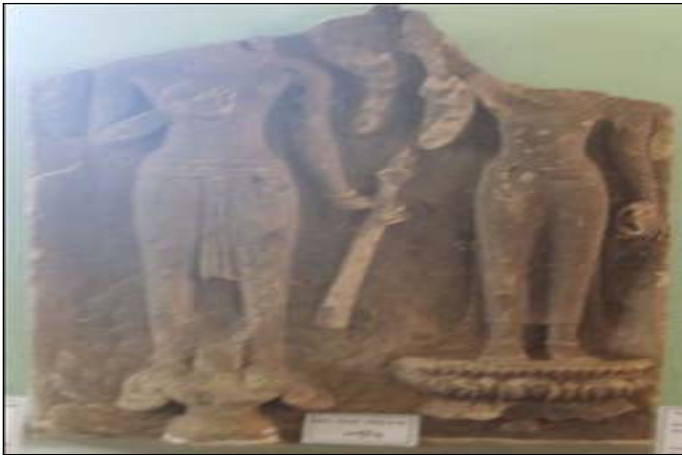
Figure 27. Srī (or) Lakshmī at Pyay Museum

A remarkable figure of Vishnu and his consort Lakshmī standing side by side was found by General de Beylie in the garden of Pyay Deputy Commissioner. It is a thin rectangular slab of soft sandstones, carved in bold relief, bearing the standing figures of Vishnu with his consort Lakshmī by his right side (Luce 1970: 216). The stone is broken from top and bottom with both heads are missing. But what remains of the slim, soft and supple figures of Vishnu standing on a Garuda and with Srī on a double lotus, is wonderfully clean and distinct. Vishnu on the left wears a short natural loincloth and twisted waistband. He has anklets and many bracelets. Srī has two hands only, holding a bunch of lotus flowers in her raised right hand. Hanging on her left side is her long, straining, sinuous hands. A defaced garuda is embellished with scales below the waist and tail feathers and wings outspread (Aung Thaw 1978: 28). It is quite unorthodox to find a stone sculpture where Vishnu and Lakshmī stand side by side. Also remarkable is the fact that this Vishnu standing on a Garuda is found in Myanmar alone. The image is dated to about 8th century A.D. (Ray 1932: 24-27) <Figure 27>. No separate image of Srī or Lakshmī image is to be found in Myanmar as an object of worship, but only as an architectural decoration which we can find everywhere on temples.