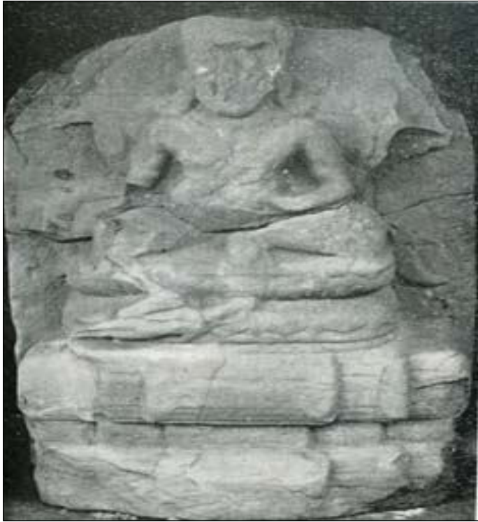
Figure 16. Shiva at Shweonhmin monastery at Myinpagan

prostrate under his right foot is the apasmārapurusha known only in South India as associated with Shiva. The apasmārapurusha was the symbol of Dirt (mala) (Ray 1932: 60-61). Coomaraswamy says that the scene has been depicted as early as the pre- Kushāna times, 1 century B.C., on the GudhimallamS'ivalirigam at North Arcot. In later times Shiva Natharāja is commonly shown dancing on it (Coomaraswamy 1927: 39).