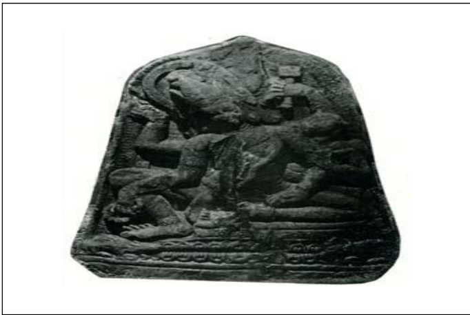
Figure 15. Stone Slab of Shiva, in bold relief from Thaton

the mallet, the upper right, probably the trident; the lower right holds the rosary, while the lower left, the citrus fruit. The snake garland falls his left shoulder. Against his left thigh sits Pārvatī , holding a yaktail flywhisk, her chin pressed between his two arms. The whole design of the weighting of the left bottom corner, the tense diagonal of the head, the zigzag energy of upper arms and knee, the fluid fall of snake-thread, lower arms and thighs is masterly (Luce 1970: 214-215). It dates 9-10 century A.D, and is in Orissan Style (Ray 1932: 79) <Figure 15>.