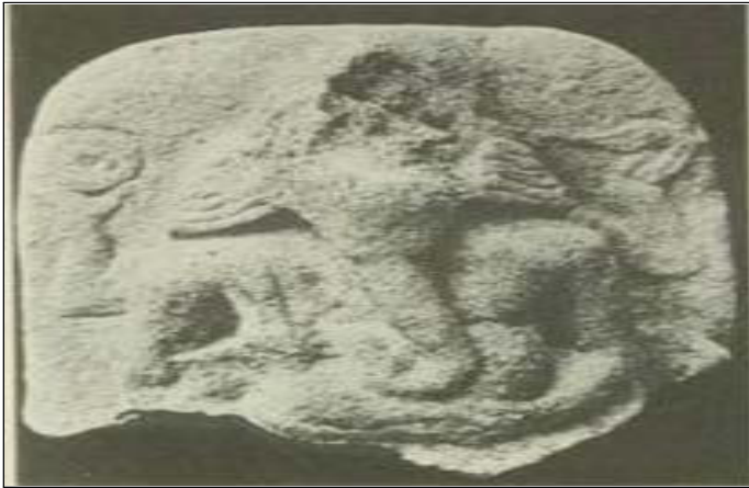
Figure 23. Ganes'a at Somingyi Pagoda