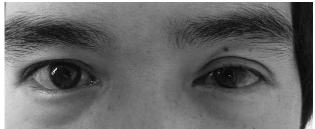
Fig. 2. Partial ptosis and miosis of left eye was presented.

On the third day of admission, his mental status improved. The sedation was weaned, and the patient was extubated. He complained of anhidrosis on the left side of the face. A meticulous physical evaluation was performed, revealing additional signs of ptosis and miosis (Fig. 2). Horner's syndrome after a first rib fracture was diagnosed. The patient was discharged 8 weeks later after orthopedic surgical treatment of the distal tibia and fibula and rehabilitation. The symptoms of Horner's syndrome were