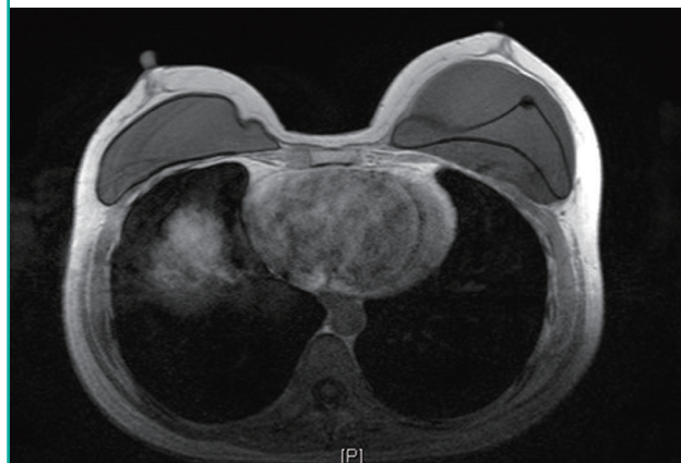
Fig. 2. Ruptured implants

An example of an magnetic resonance imaging of a ruptured silicone implant.