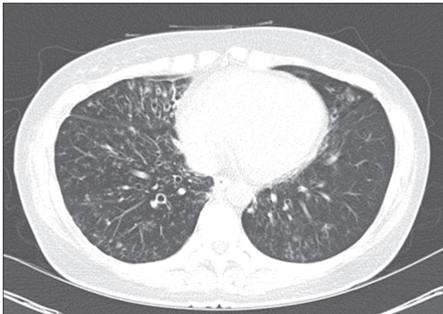
Figure 1. An initial chest computed tomography scan of the studied patient showing bronchiectatic changes with small centrilobular nodules in the lingular division of the left upper lobe, the right middle lobe, the right lower lobe, and the left lower lobe.