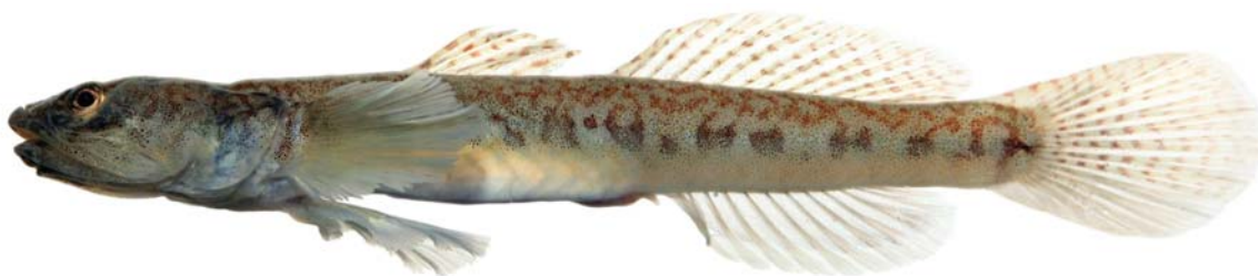
Fig. 1. Gymnogobius cylindricus (Tomiyama), NIBR-P20318, 49.9 mm SL, collected from Incheon River estuary, southwestern coast of Korea.

Material examined. NIBR-P20318, 49.9 mm in standard length (SL), male, N 35° 32' 40.93'' N, 126° 35' 07.47'' E, Yonggi-ri, Shimwon-myeon, Gochang-gun, Jeonbuk-do, Korea, Incheon River estuary, 19 April 2011, collected by Ho-Bok Song and Seung-Ho Choi.