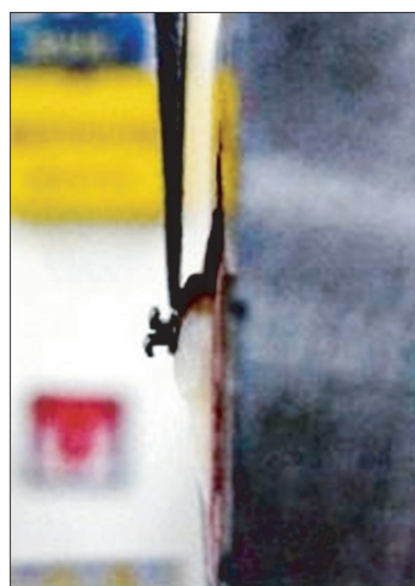
Figure 1. Shear bond strength test with the Instron machine showing where the debonding force was applied.

Teeth in group 1 were etched with 35% phosphoric acid for 15 seconds, washed for 10 seconds, and air-dried. Transbond XT primer was applied and light-cured for 10 seconds. Brackets were bonded with Transbond XT resin. Teeth in Group 2 were treated with TPSEP, which was rubbed on the enamel surfaces for 5 seconds and gently air-dried for 5 seconds. Brackets were bonded with Transbond XT resin. Maxillary premolar metal brackets (Victory Series™ brackets; 3M Unitek, Monrovia, CA, USA) were positioned parallel to the base of the acrylic block. In groups 3 and 4, the teeth were pre-treated with CPP-ACP paste (Toothmouse; GC Co., Tokyo, Japan) for 2 weeks before the brackets were bonded. This protocol was selected because previous work has shown that the remineralizing effects of CPP-