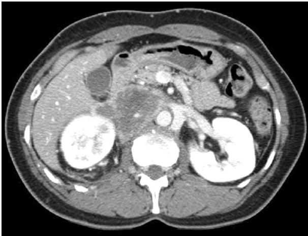
Fig. 1. The abdominal computed tomography scan shows an intracaval leiomyosarcoma infiltrating the right kidney and liver.