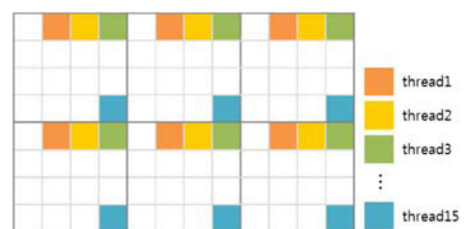
Fig. 3. Parallel DCT-IF.

OpenMP is a widely-used technique for multithread parallelization. DCT-IF can be implemented in high parallelism, because there are no