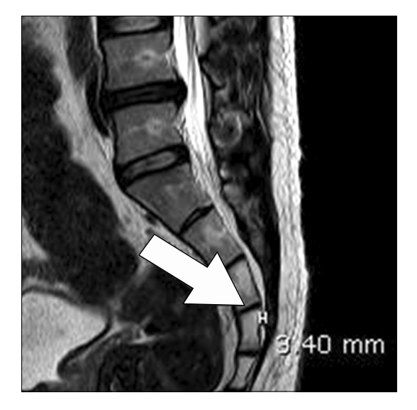
Fig. 1. A lumbosacral MRI sagittal plane image showing a narrow sacral canal.

arriving at the operating room. The position was adjusted