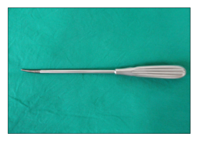
Fig. 2. The hiatus rasp.