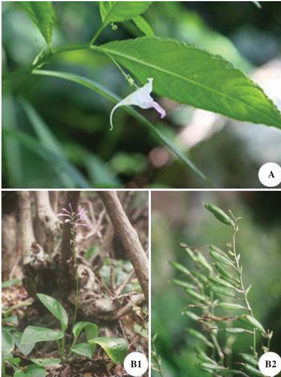
Fig. 2. Two remarkable plants in Jang-do (Isl.). A. Impatiens furcillata . B. Flowers of Hosta yingeri . B2. Fruits of Hosta yingeri .