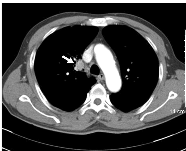
Fig. 1. Chest computed tomography scans showing a 2.5-cm nodule (arrow) in just the medial aspect of the truncus anterior pulmonary artery and the right upper lobe with no evidence of lymph node enlargement in the mediastinum.

T3N2M0 (stage IIIa). The patient was discharged uneventfully on the eighth postoperative day. During 3 months of follow-up he was administered three cycles of adjuvant chemotherapy.