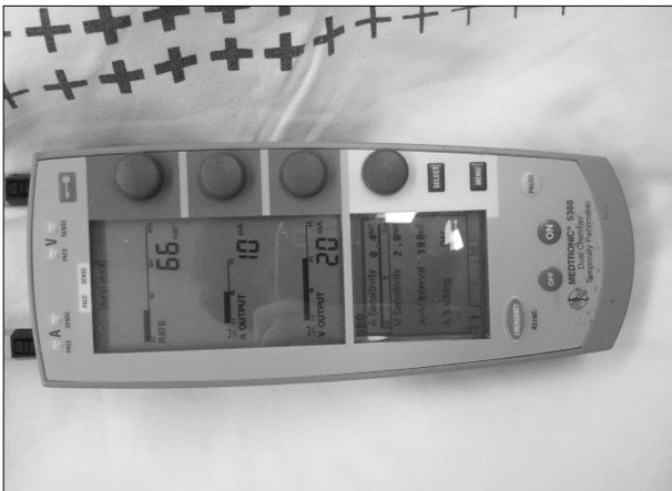
Fig. 1. The pacemaker used in this case (Medtronic 5388 Dual Chamber Temporary Pacemaker; Medtronic Inc.).

The patient's postoperative vital status was stable on intravenous dopamine and nitroglycerin. CRT was used for 18 hours. A cardiac output of 3.8 L/min was maintained after turning the CRT off, and the cardiac output was 3.9 L/min