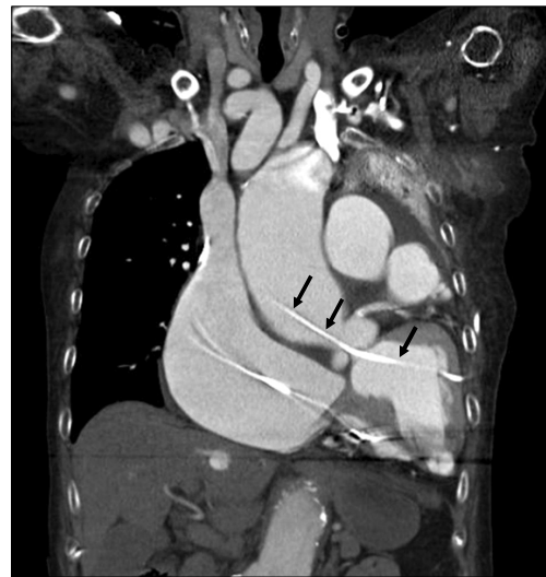
Fig. 2. Computed tomogram of the chest. Both atria and great arteries were dilated and displaced to the left hemithorax with atelectasis of the left lung. The catheter tip was placed in the ascending aorta through the aortic valve and left ventricular cavity (arrows).

aortic valve with the tip of the catheter located in the ascending aorta. Transthoracic echocardiography revealed mild aortic regurgitation with a small amount of pericardial effusion without hemodynamic significance.