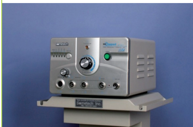
Fig. 2. Surgical tool

The radiofrequency surgical unit (4 MHz radiofrequency Dr. Oppel ST-501).