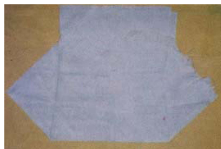
Fig. 2. Sojungi.

Kinds of shrouds we saw there were formidable in its numbers of one suit of shrouds. They were more than 20 kinds such as Korean style mattress used as a bed on the floor, blanket(A green neckband is put around for men and a red neckband is put around for women), pillow, underpants(Sojungi : underwear for women) (Fig. 2), Ddambadae(patch gusset), Jeoksam(an unlined summer jacket), Jungi(unlined) Jeoksam(summer jacket of women), Jeogori(upper garment of Korean traditional women clothes: two sets of clothes for women) and trouser(Trouser Jungi and two sets of skirts for women), Daenim(ankle band), Beoseon(Korean socks), Aksu(hand wrapping cloth), Eomdu covering the head and