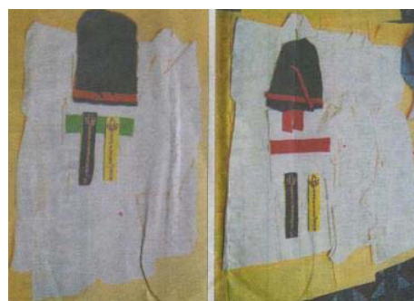
Fig. 3. Myeongmok.