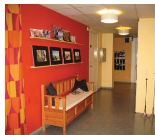
Figure 2. Swedish cohousing communities (Trädet : Mixed-age, Russinet and Majbacken : +40)

There have been many discussions about the subject which is better composition of cohousing residents in terms of age group in order to elevate resident’s life satisfaction. Which is considered as better living arrangement for the third age between the +40