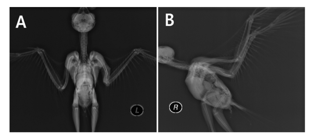
Fig 1. Ventrodorsal (A) and right lateral (B) radiographs revealing left humerus fracture.

The green patch obtained from the surface of lung was cultivated on Sabouraud dextrose agar (Difco, NJ, USA) at 30°C for 7 days and blue-green colonies with velvet-like appearance were identified suggesting Genus Aspergillus . For identification, molecular analyses of ITS region, \beta -tubulin and calmodulin genes were performed as described previously (6). After the amplification of the genes, the amplicons were sequenced by ABI Big Dye Terminator Cycle Sequencing