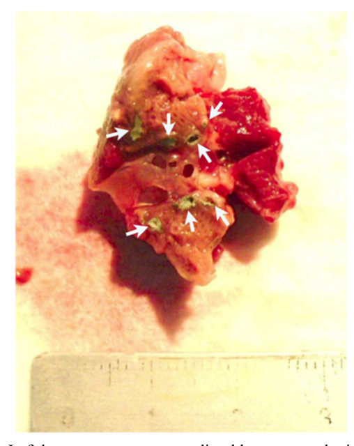
Fig 2. Left lung on necropsy revealing blue-green colonies with velvet appearance into the bronchi (arrows).

On necropsy, 2-3 mm green patches with ground grass appearance were widespread on the surface and inside of left lung (Fig 2). After dissection of the left lung, the cutting surface was imprinted on the glass slide and stained with Diff-Quik. The stained smear revealed several fungal hyphae and