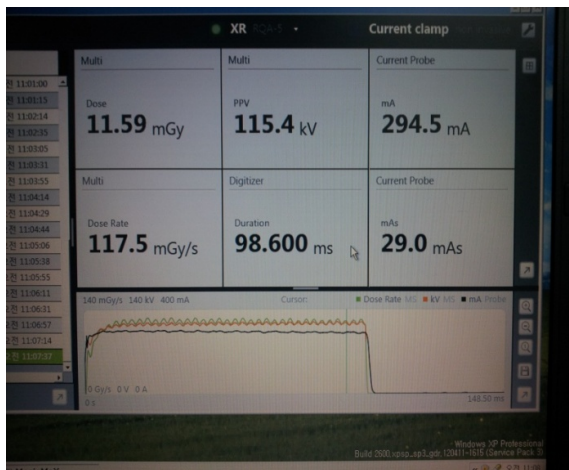
Fig. 2. Measured value & waveform of clamp meter

Depending on rectification method of the devices, the average values were derived by measuring the tube current three times at 80kV, the most frequently used tube voltage, and at 120kV, which was a high tube voltage, while changing the tube current to 50mA and 100mA at small focus as well as 200mA and 300mA at large focus. At that time, the exposure time was fixed at 0.1sec.