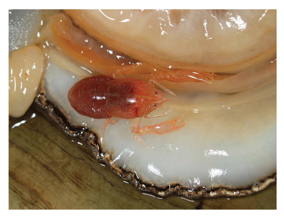
Fig. 1. Conchodytes nipponensis (De Haan, 1844), an ovigerous female, in the mantle cavity of the pen shell Atrina pectinata.

Pontonia nipponensis: De Haan, 1849, p. 180.