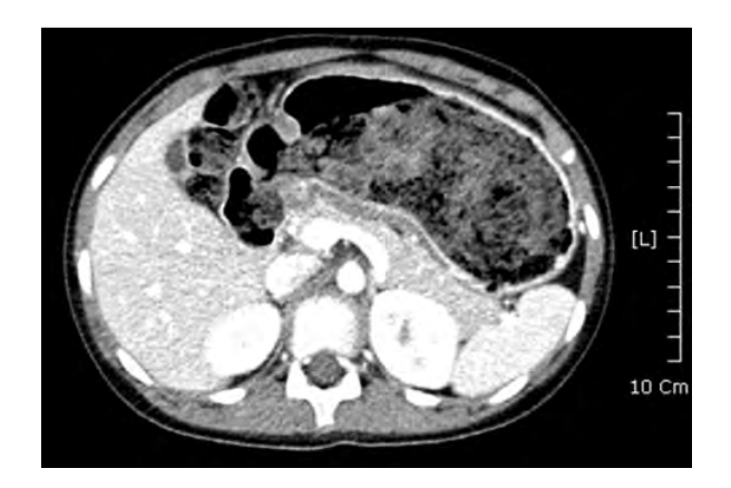
Fig. 1. Abdominal computed tomography scan reveals a huge, free-floating heterogeneous solid mass with mottled gas pattern in the markedly distended stomach.

An 8-year-old girl was referred to our pediatric clinic with a 3-month history of palpable abdominal mass, epigastric pain, and intermittent vomiting that worsened after meals. Her mother reported several episodes of vomiting, which consisted of undigested recently eaten food. There was no history of recent illness, fever, diarrhea, or ingestion of toxic substances. Physical examination of her abdomen revealed hyperactive bowel sounds and a palpable firm mass in the epigastric region (approximately 15 \times 10 cm). No acute peritoneal signs were evident. The patient had long hair, and no erythema, scaling,