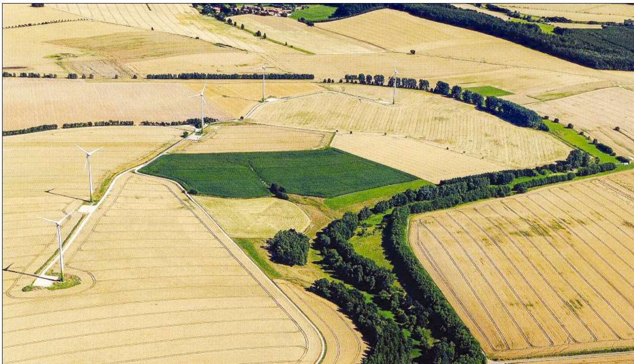
Fig. 4. The German Green Belt

The production share of environmental protection goods in relation to all industrial products has increased in Germany from 4.7% in 2002 to 5.7% in 2009. From 1993 to 2009 the global share of exported German environmental goods was nearly constant, whereas the export from other countries, such as United States, Japan, United Kingdom and France less or more dramatically dropped (Schasse, Gehrke and Ostertag 2012). It has been estimated that the number of newly created jobs in Germany in the renewable energy sector was more than 200,000, starting from 160,500 in 2004 to about 367,400 in 2010 (Federal Environment Agency 2012). In 2010 the expenditure for renewable energy plants in Germany was about €27 billion (GFME 2011).