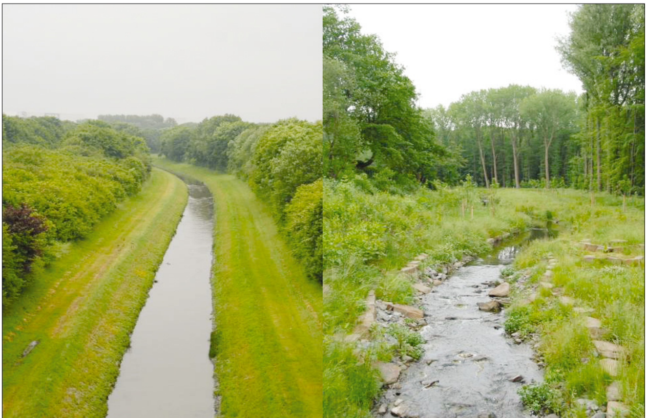
Fig. 3. Emscher river before (left) and after (right) its renaturation in the city of Dortmund

One of the most outstanding revitalization projects in Germany is the Emscher renaturation, which is a paradigm for the new trend of taking into account challenges of sustainability as well as climate change into urban development. This project is focussed on the renaturation of the 80 km long Emscher river, which has been used as sewer for more than hundred years. The €5 billion project aims at establishing a huge landscape park instead of the old open sewer system. Emscher landscape park will comprise cooling green spaces, areas for flood control, recreation areas and habitat network and therefore enhance life quality in Ruhr metropolitan area, especially under future climate conditions (Gruehn 2010). Fig. 3 points out how the Emscher water course has changed after the renaturation during the last couple of years. The efforts which have been undertaken in the Ruhr region in the last decades did not only contribute to the structural change in terms of economics but also to a positive mental change how people perceive the region.